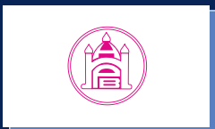
HAJEE A.P BAVA & CO Karnataka, India