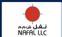
NAFAL CONTRACTING LLC Oman, UAE