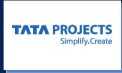
TATA PROJECTS LIMITED Maharashtra, India