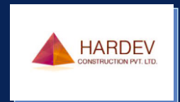
HARDEV CONSTRUCTION Jharkhand, India